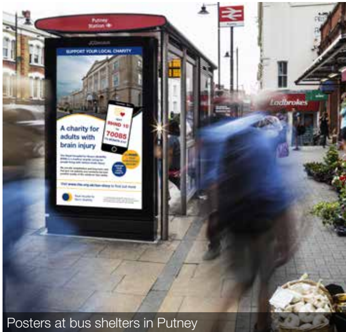
Posters at bus shelters in Putney