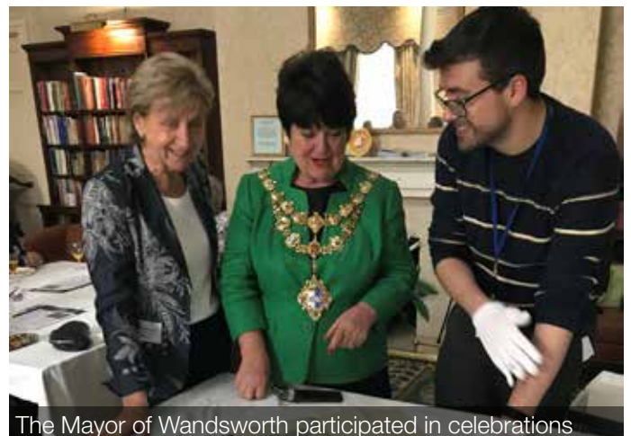
The Mayor of Wandsworth participated in celebrations

We'd like to thank everyone at the RHN and local community who contributed to another successful festival – we can't wait for next year!