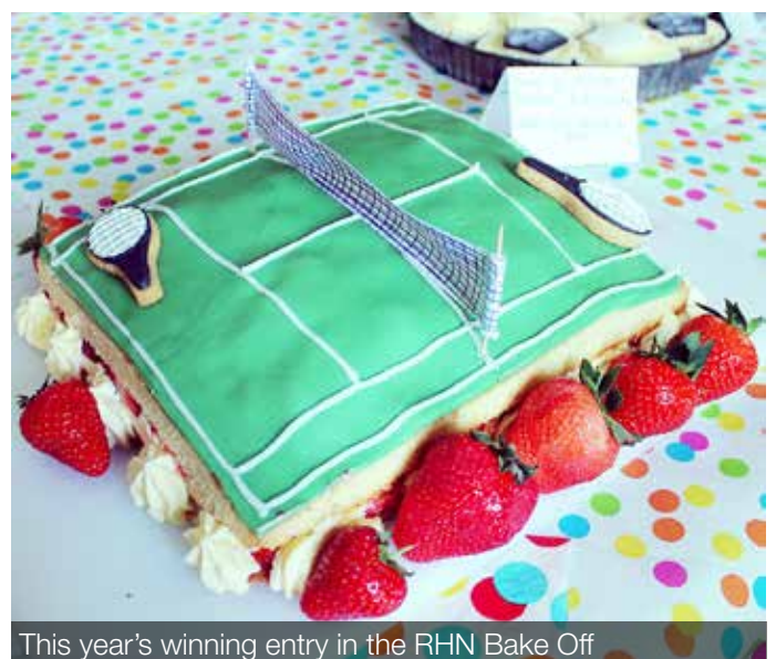
This year's winning entry in the RHN Bake Off