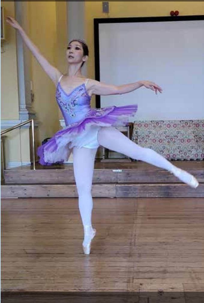
Above: The 'Putney Chiefs' entertain staff Below: A dancer from The Chelsea Ballet Company