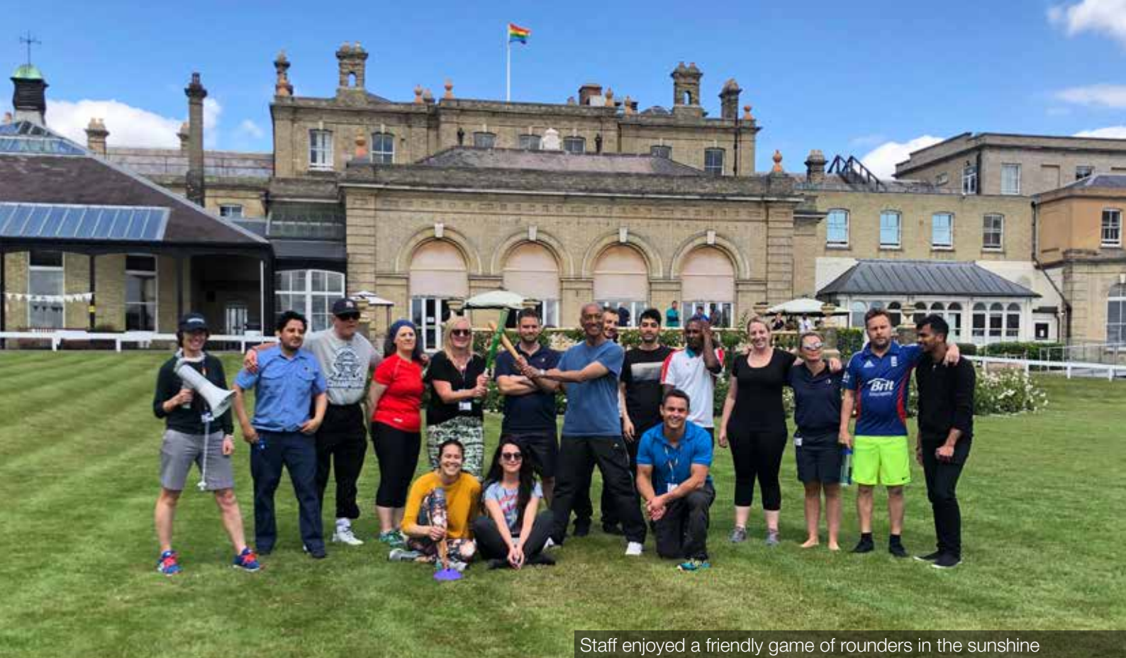
Staff enjoyed a friendly game of rounders in the sunshine